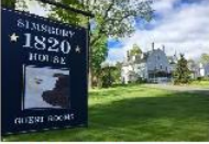
The Simsbury 1820 House Sonn Grill Dining & Events (860) 655-7656 www.Simsbury1820House.com

Simply Extraordinary! • Down Feather Beds, Comforters, Pillows • Flat Screen TV's, Internet, Premium Cable • Manicured Grounds and Gardens • Imported Cotton Sheets • Complimentary Continental Breakfast • Luxurious Marble Bathrooms • Luxurious Bath Amenities, In-Room Safe, Original Art, Antiques, Restaurants & Bars • Corporate Meetings and Wonderful Weddings www.ClassicHotelsOfCT.com