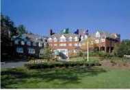
The Simsbury Inn Evergreens & Twigs Lounge (860) 651-5700 www.SimsburyInn.com